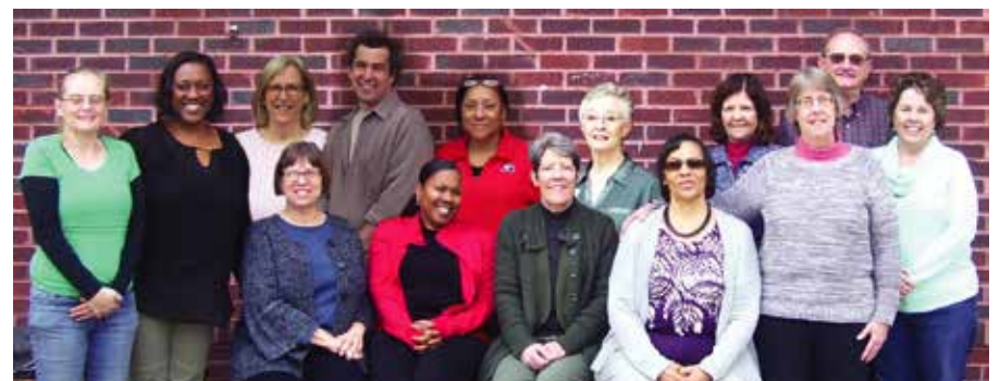
From Left to Right

It is through the support of our local churches, businesses, foundations and individuals that make this ministry possible. Together we are making a difference in our community.