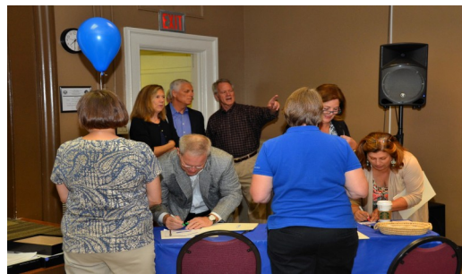
Guests are arriving to the Annual Partner's Breakfast.